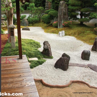
Landscaped Zen Garden